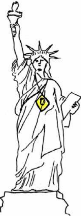
Something more ambitious...